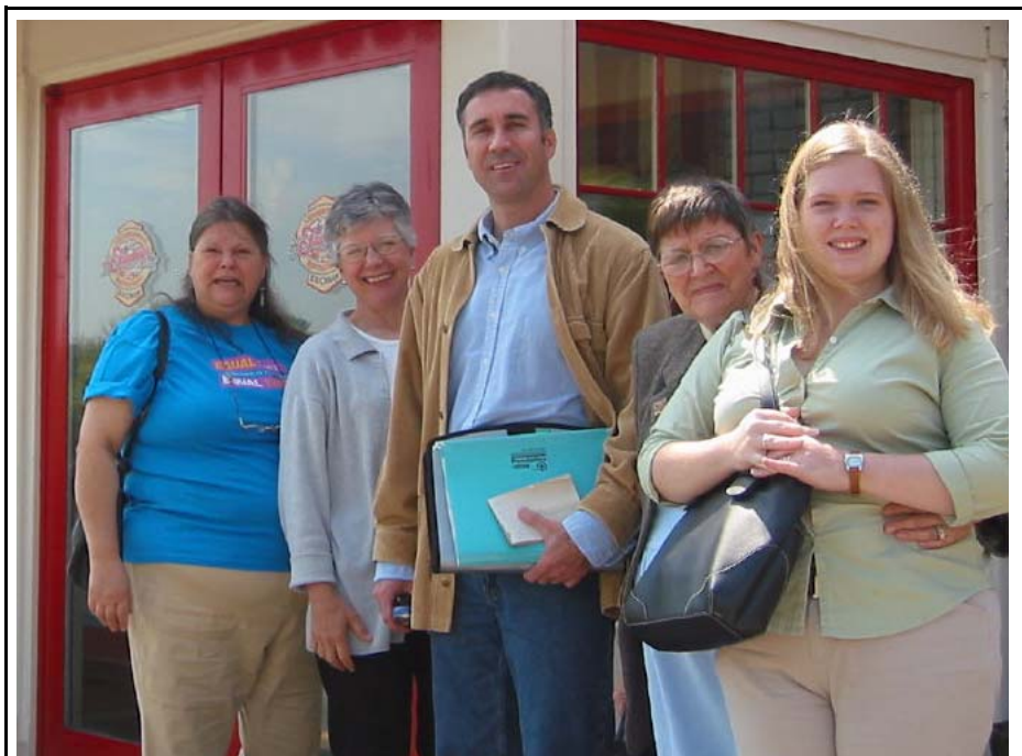
PFLAG National's NE Tour stops at Friendly's

The Human Rights Campaign is the largest national lesbian, gay, bisexual and transgender political organization with members throughout the country. It effectively lobbies Congress, provides campaign support and educates the public to ensure that GLBT Americans can be open, honest and safe at home, at work and in the community.